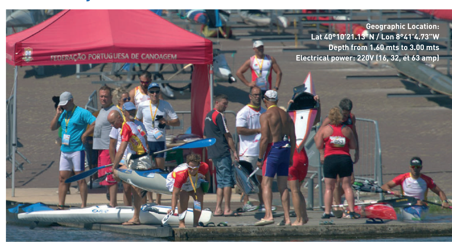
The High performance Centre provides top level conditions, including a special wind barrier to avoid side winds during competitions. Venue Layout will be published later at canoesprintportugal.com