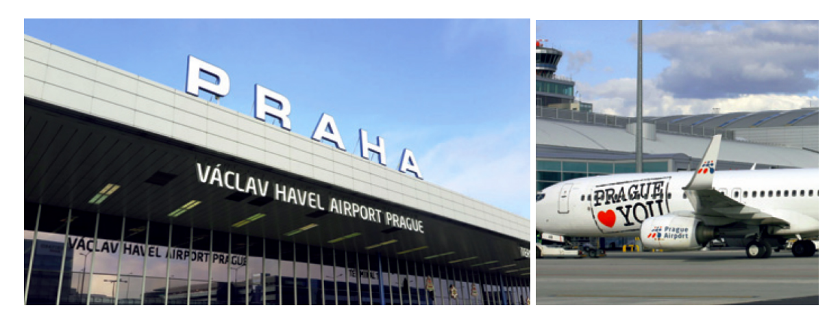
From Václav Havel International Airport Prague (PRG) to Prague Troja Venue it is about 20 km, approx. 40 min.

International Airport - Václav Havel Airport Prague (PRG) is a flight hub used by more than 40 airlines that travel to hundreds of destinations. It has three passenger terminals. Terminal 1 is used for flights outside the Schengen zone, while Terminal 2 is used for flights within the Schengen zone and Terminal 3 is for private and charter flights. You can get all the relevant information on the non-stop phone lines +420 220 111 888.